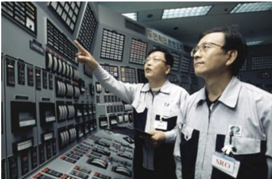
Main Control Room where real-time data is a vital part of decision-making and operations.